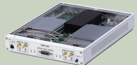
Image of two TwinRX daughterboards inside a USRP X Series motherboard connected with LO sharing cables